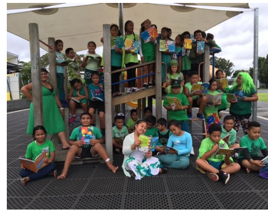
There were Frozen princesses and Green eggs and ham (I don't think anyone wanted to make and eat Green eggs.)