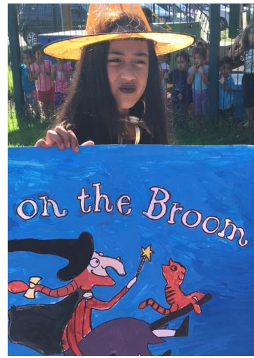
A Maori Warrior and A witch on a broom!