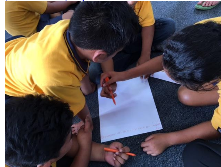
(Pupils in their thinking groups)

In the old days you were given a way to solve a problem and you just did it.