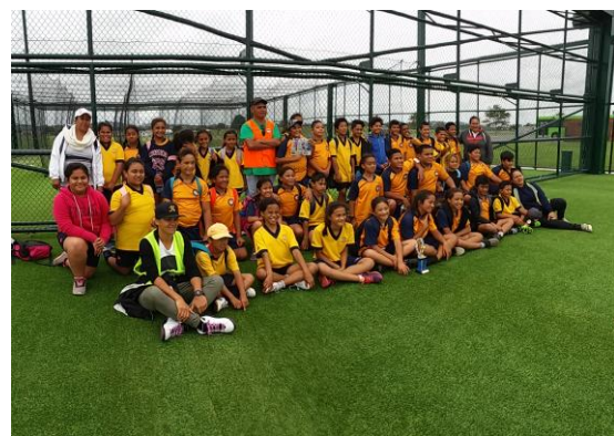
SEHC Junior School Touch Team

One of our boys in action, blocking- you shall not pass!