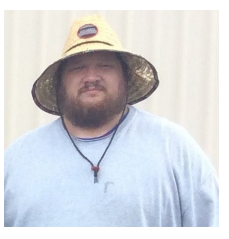
Manu Art / Sports Tutor