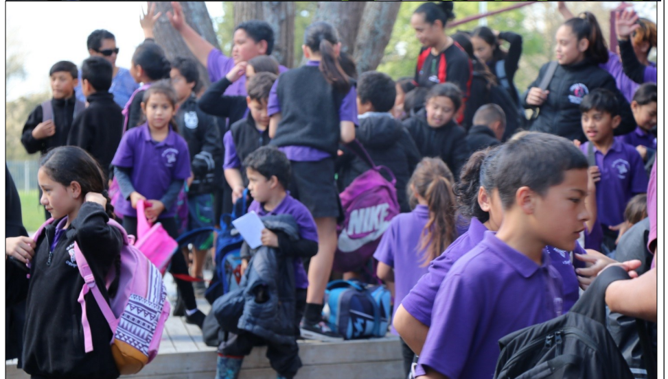
Piripono School came and joined in with our Maori Arts and Crafts Activity Day.