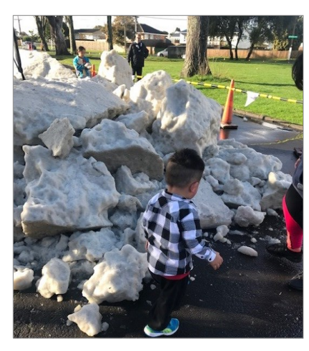
Snow comes to Otara!