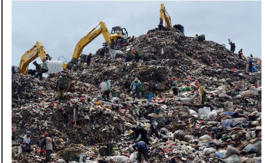
Every year NZ landfills keep growing...

It is estimated that in Aotearoa New Zealand we generate 17.49 million tonnes of waste per year, of which an estimated 12.59 million tonnes are sent to landfill. This is a staggering amount. last week we had a waste audit. We collected 133.08kgs of waste- this is one day's rubbish. Not a pretty thing to do but it gave us insight into what rubbish we have and how we can look at ways to reduce our waste in the future.