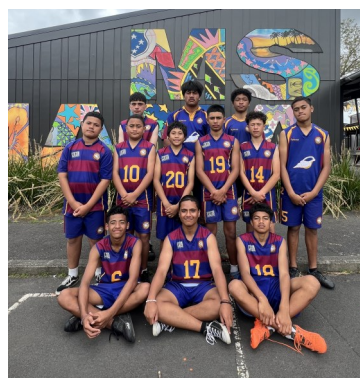
Boys Touch Team 2023