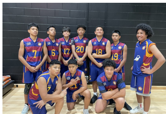
Boys Volleyball Team 2023