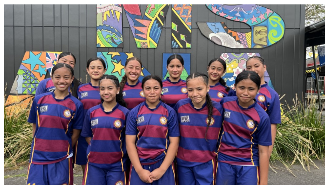
Girls Touch Team 2023

Our boys volleyball team had qualified for the AIMMS finals and participated in this championship at Northshore Events Centre. This was a hard fought championship where we won two games a